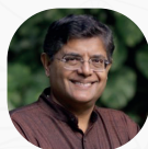
Shri Baijayant Jay Panda

Chairman, 15th Finance Commission of India