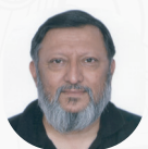
Shri Shakti Sinha

Former Commander-in-Chief, Western Naval Command, Indian Navy