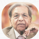
Shri N K Singh

Chairman, 15th Finance Commission of India