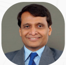
Shri Suresh Prabhu

National Vice President and Spokesperson, BJP