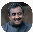
Shri Ram Madhav

Member, Board of Governors, India Foundation; Member, National Executive, RSS