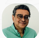
Shri Swapan Dasgupta

India's Sherpa to G20, Former Union Minister