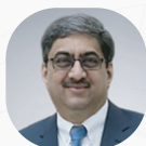
Shri. Gautam Bambawale

Former Secretary, Ministry of External Affairs, India