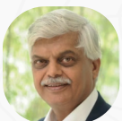
Shri Sanjaya Baru